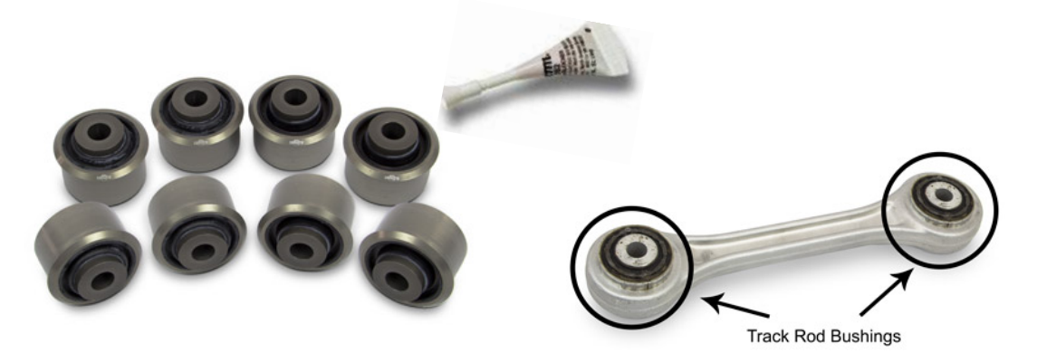
Rear Track Rod Concentric Sealed Monoball Kit

Our fully sealed monoball cartridge kits feature maintenance free PTFE linings requiring no supplemental lubrication. We've designed in weather seals to keep dirt out and extend product life. This is the only monoball suitable for street or extended track use. Dirt and water contaminate ordinary products and accelerate wear.